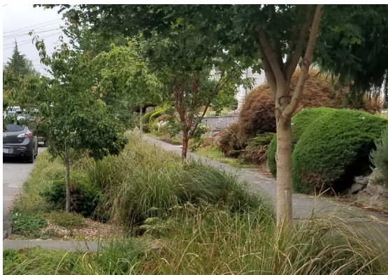
An example of a completed natural drainage system on a residential street.