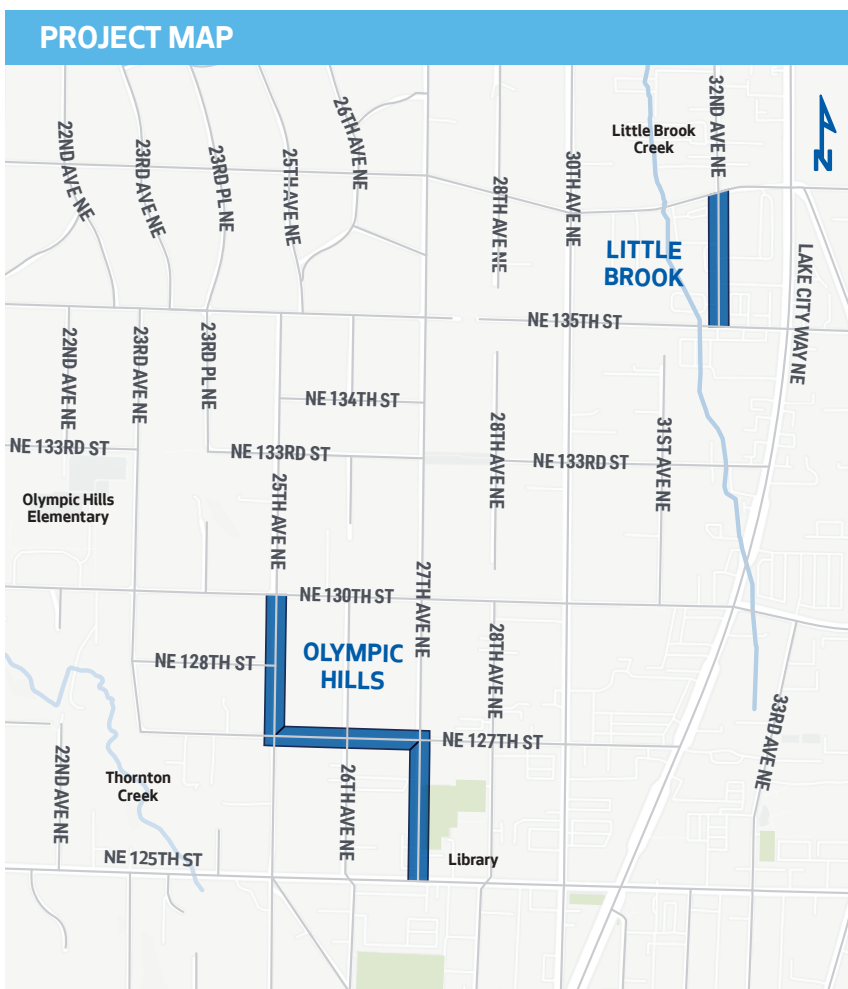
This map shows the locations selected for natural drainage systems. We studied a larger area that is not pictured here.

In 2025 and 2026, we will continue to gather feedback and share updates with the community, complete the project design, and hire a contractor. We anticipate construction will begin in 2027. This schedule is subject to change as the project progresses.